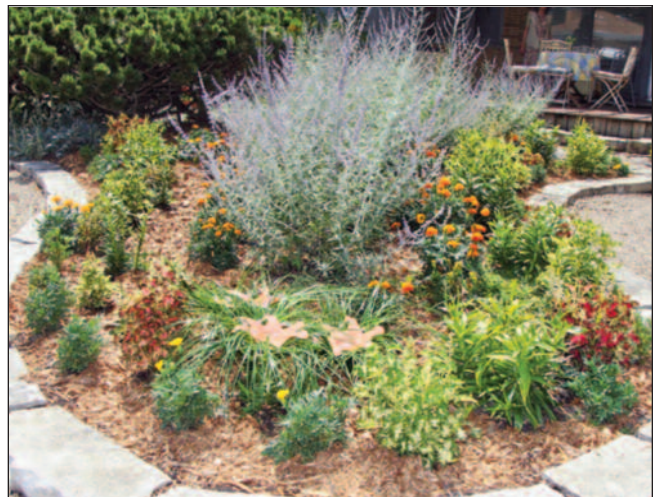
Virginia Chandler's garden

Join Penny for a new year of quilting and camaraderie. Learn how to construct Main Street houses with the Weekend Quilters on Sat Sep 15 and Oct 20. Create a kaleidoscope effect quilt at Stack 'n Whack on Mon Oct 1 and Wed Oct 17.