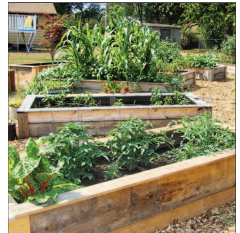
United by Faith Community Garden

Information about the Lions and other agencies assisting the visually impaired will be available.